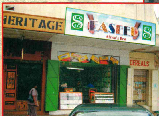
"The NewLook" EASEED retail shop at Muindi Mbingu Street, Nairobi.