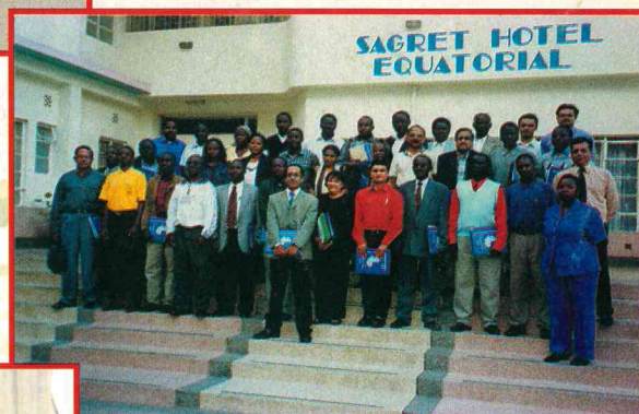
The EASEED Team after a sales seminar held on 15th September 2002

This seems to be the idea behind this exercise of team building.